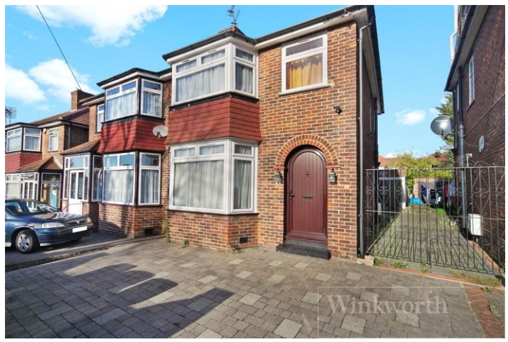
DRYBURGH GARDENS, KINGSBURY LONDON, NW9 £1,700 PER MONTH UNFURNISHED