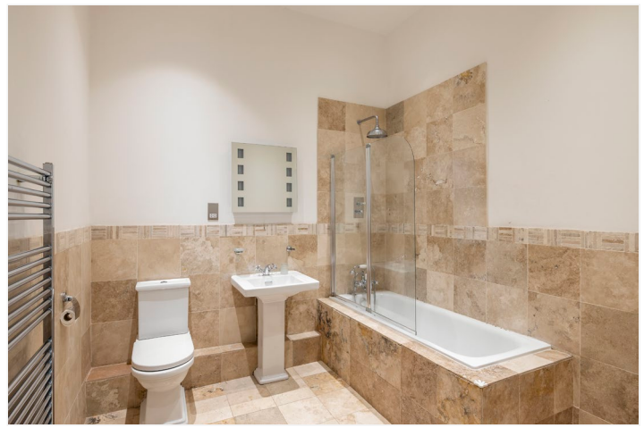
LEIGHAM COURT ROAD, SW16 £2,200 PER MONTH UNFURNISHED