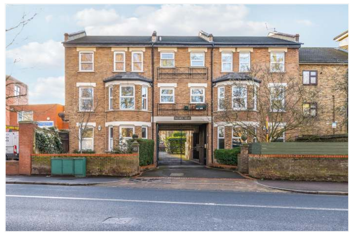
DULWICH MEWS, EAST DULWICH, SE22 £425,000 SHARE OF FREEHOLD