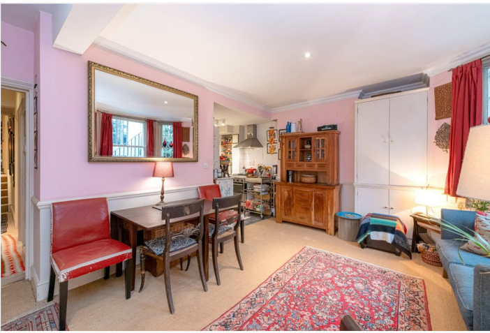
CHESTERTON ROAD, W10 £675,000 SHARE OF FREEHOLD