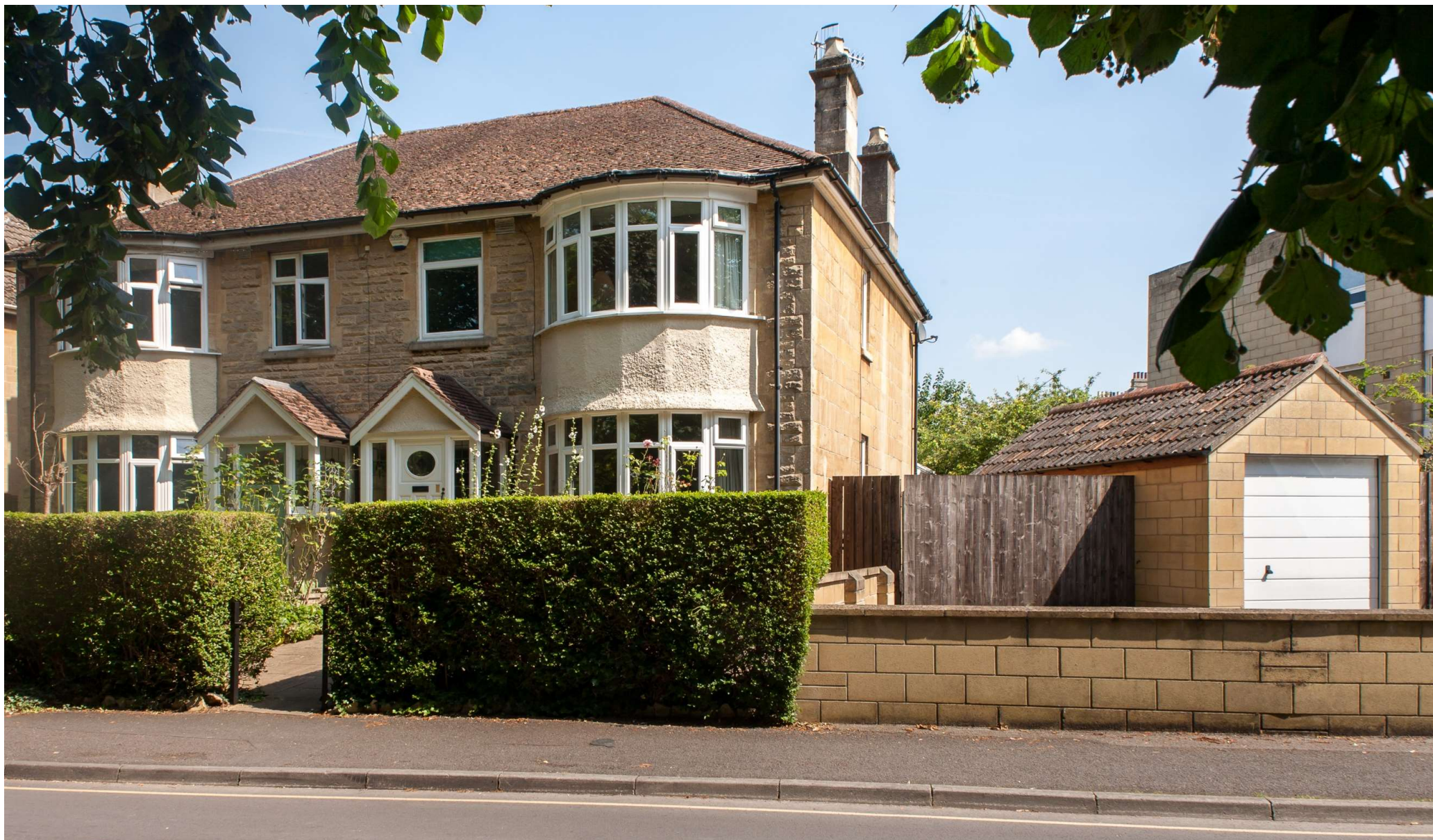
16 HENRIETTA GARDENS, BA2 £900,000 FREEHOLD