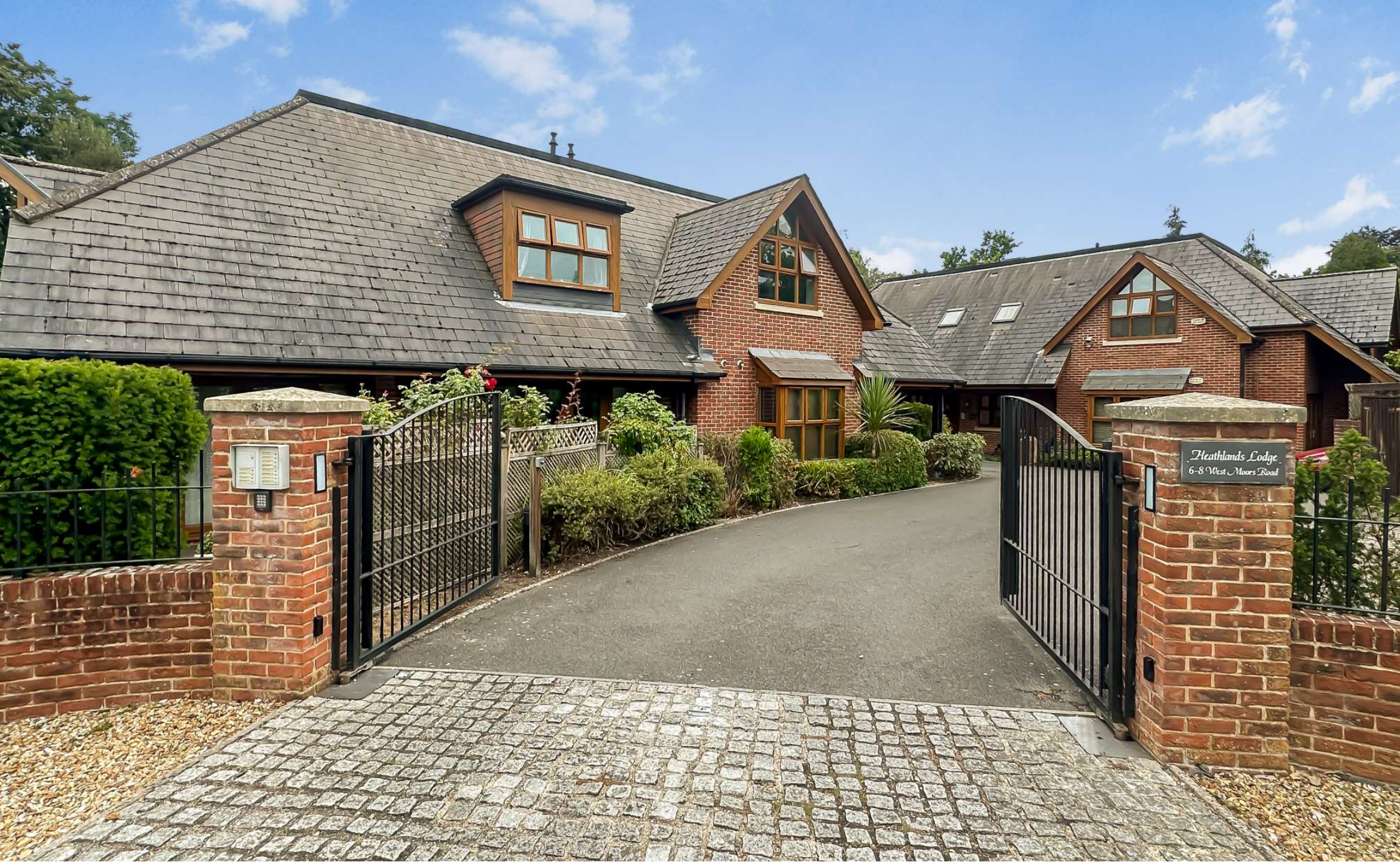
Heathlands Lodge West Moors Road, Ferndown BH22 9DS Guide Price £240,000