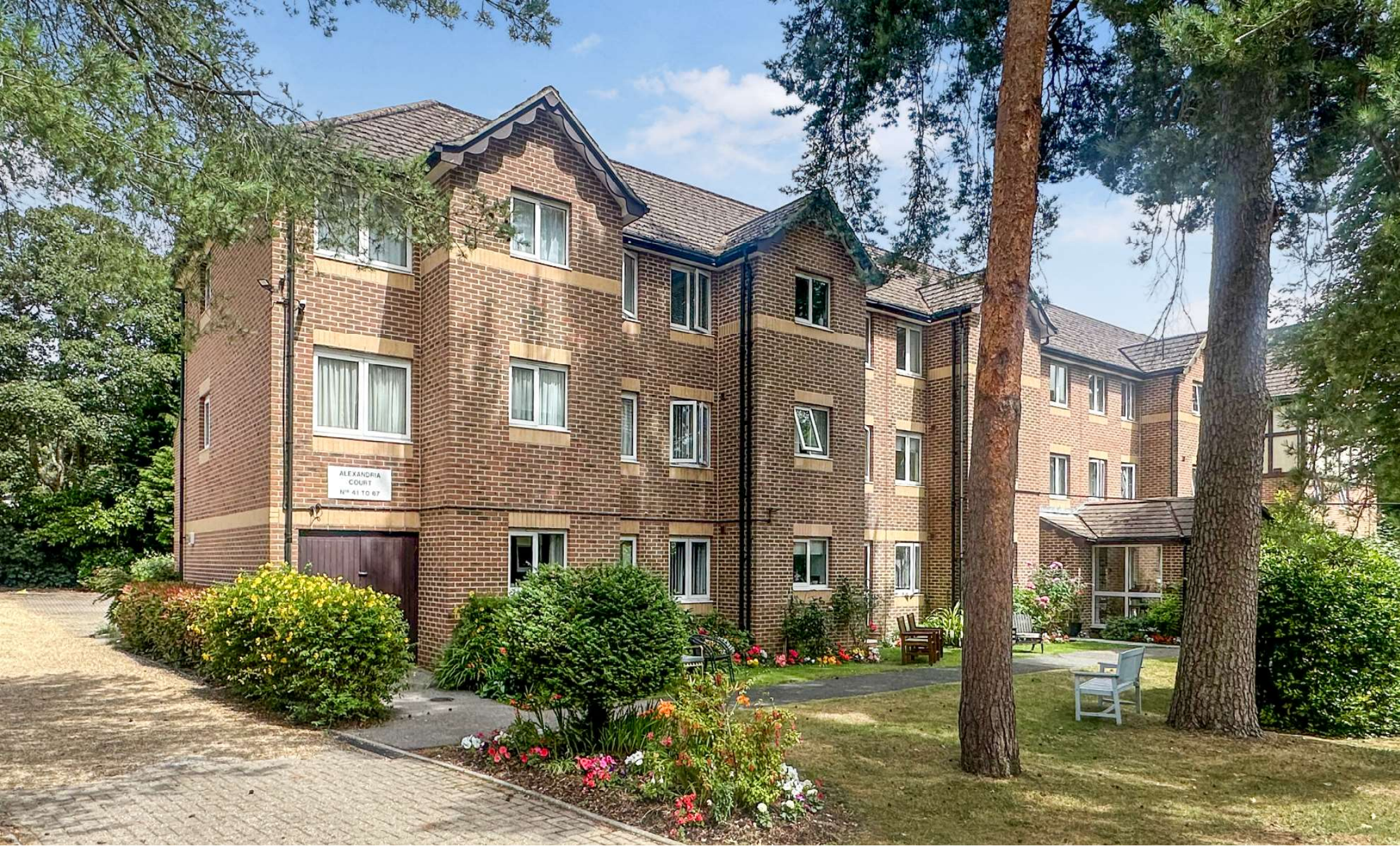
Alexandria Court, West Parley, Ferndown BH22 8PW Guide Price £125,000