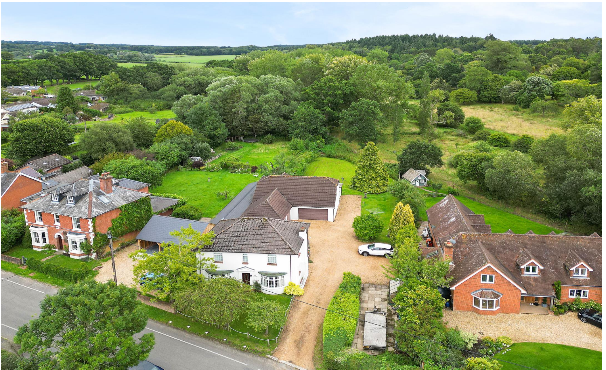
Brook House, Crook Hill, Braishfield, Romsey SO51 0QB