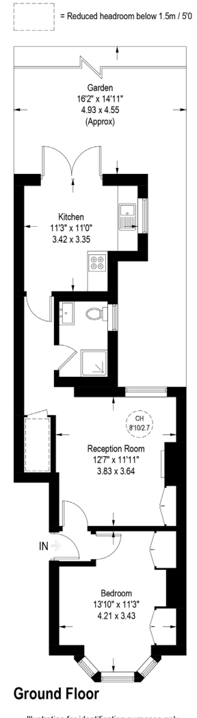
Illustration for identification purposes only, measurements are approximate, not to scale. (ID1010738)

Approximate Gross Internal Area = 498 sq ft / 46.3 sq m (Excluding Reduced Headroom) Reduced Headroom = 14 sq ft / 1.3 sq m Total = 512 sq ft / 47.6 sq m External Area = 343 sq ft / 31.9 sq m