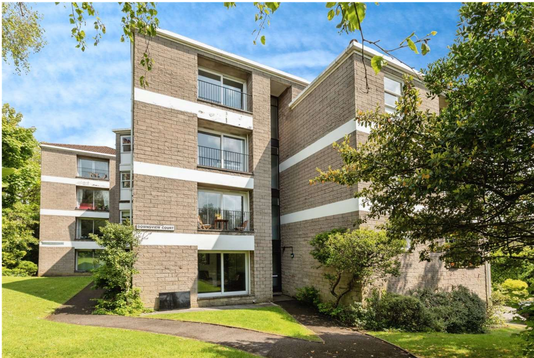
DOWNSVIEW COURT, CLIFTON, BRISTOL, BS8 £360,000 LEASEHOLD