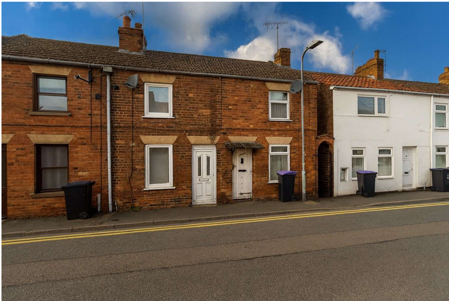
7 HERWARD STREET, LINCOLNSHIRE, PE10 9EX £99,950 FREEHOLD