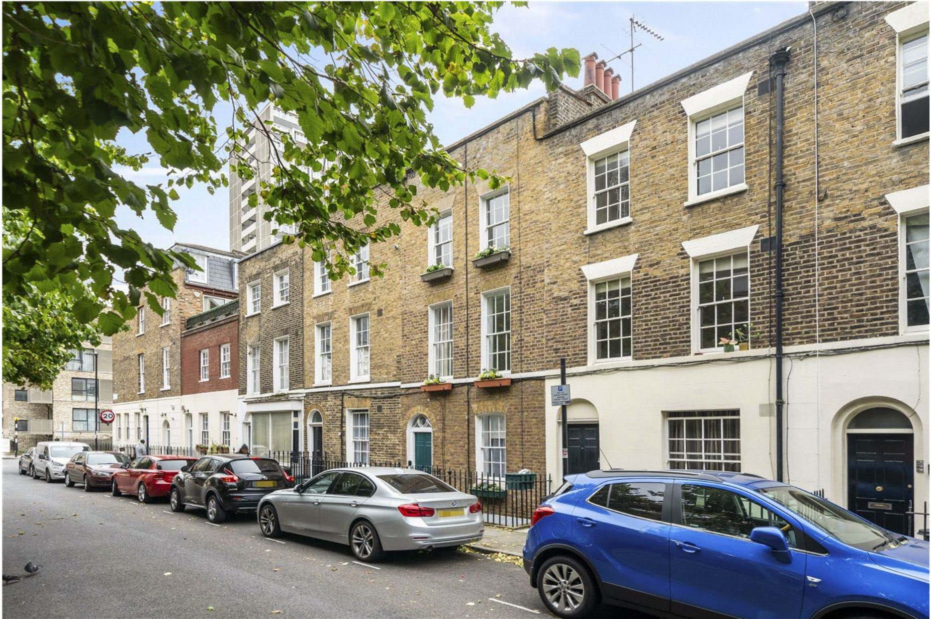
ASHBY STREET, EC1V £1,500,000 FREEHOLD