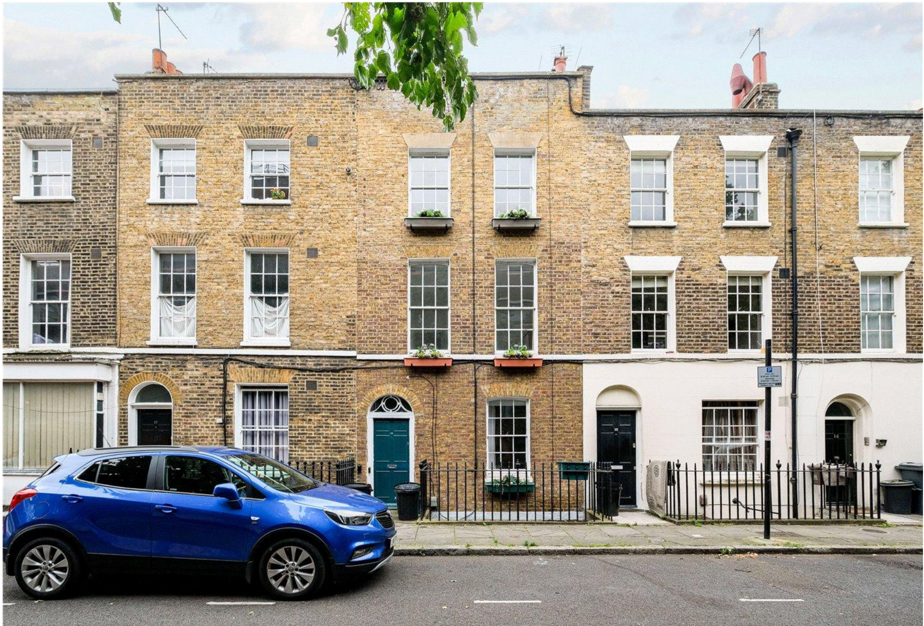
ASHBY STREET, LONDON, EC1V £1,500,000 FREEHOLD