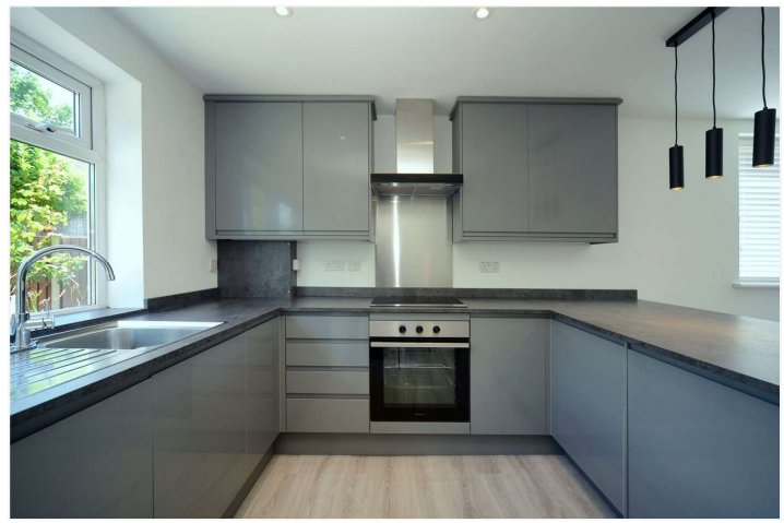
ARDROSSAN GARDENS, WORCESTER PARK, SURREY, KT4 £1,600 PER MONTH

Tenant Fees Apply: Details of fees for tenant referencing, tenancy agreement admin fees and renewal fees are available on the Winkworth website and the link can be found with the displayed rent for the property. Tenants should ensure they are fully conversant with these upfront fees and other costs that are involved at the outset of the tenancy before making an offer to rent and your local Winkworth office will provide written details upon request.