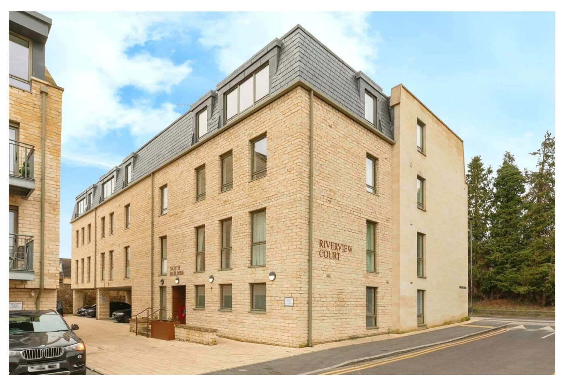
FLAT 7 NORTH BUILDING, RIVERSIDE, BATH, BA1 £350,000 LEASEHOLD