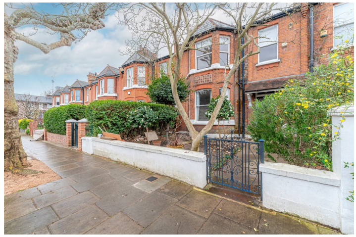
HIGHLEVER ROAD, LONDON, W10 £1,300 PER WEEK UNFURNISHED