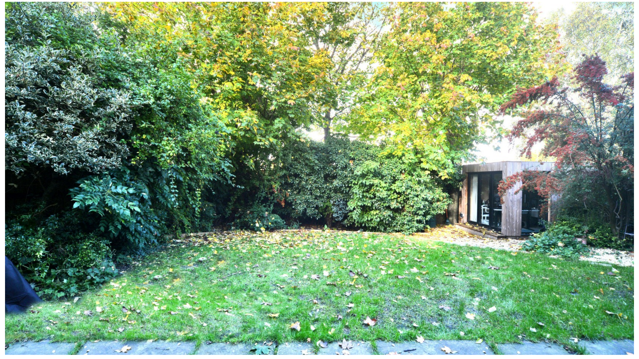
Under the Consumer Protection Regulations 2008, these Particulars are a guide and act as information only. All details are given in good faith and are believed to be correct at time of printing. Winkworth give no representation as to their accuracy and potential purchasers or tenants must satisfy themselves by inspection or otherwise as to their correctness. No employee of Winkworth has authority to make or give any representation or warranty in relation to this property.