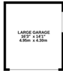
OUTBUILDING 229 sq.ft. (21.3 sq.m.) approx.

Whilst every attempt has been made to ensure the accuracy of the floorplan contained here, measurements of doors, windows, rooms and any other items are approximate and no responsibility is taken for any error, omission or mis-statement. This plan is for illustrative purposes only and should be used as such by any prospective purchaser. The services, systems and appliances shown have not been tested and no guarantee as to their operability or efficiency can be given. Made with Metropix ©2025