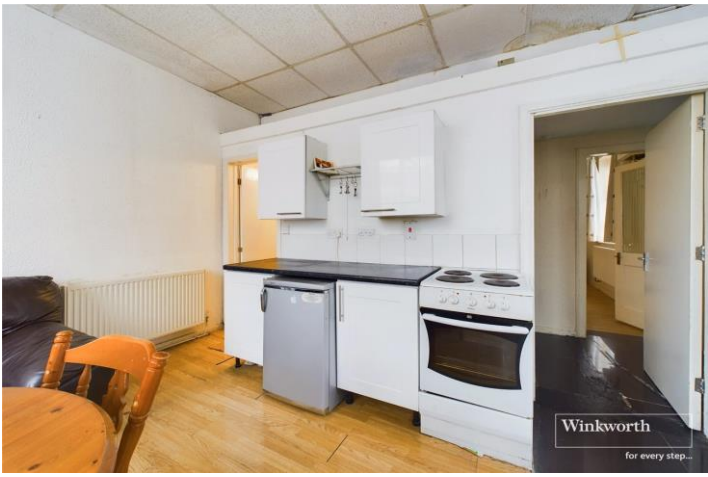
SLOUGH LANE, KINGSBURY, LONDON, NW9 OFFERS IN EXCESS OF £600,000 FREEHOLD