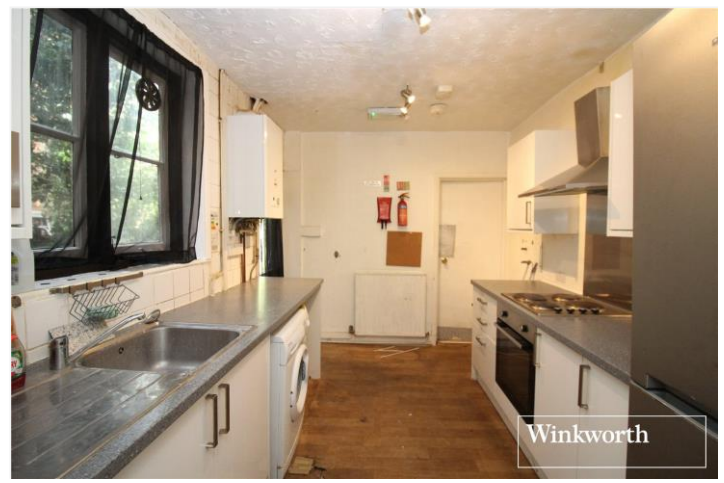
DRAYTON ROAD, HERTFORDSHIRE, WD6 £465,000 FREEHOLD