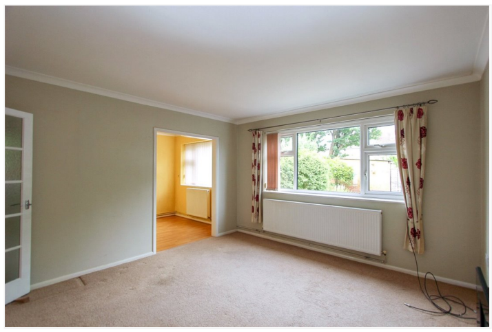
CHALKWELL PARK DRIVE, LEIGH ON SEA OIEO:- £275,000 FREEHOLD