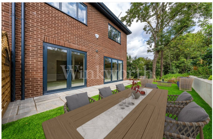
THE BROOKDALES, NW11 £799,000 LEASEHOLD