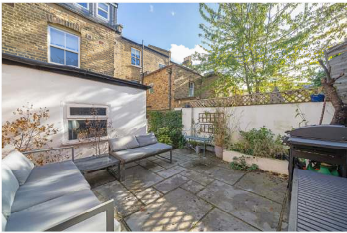
IVANHOE ROAD, CAMBERWELL, SE5 OIEO £450,000 LEASEHOLD