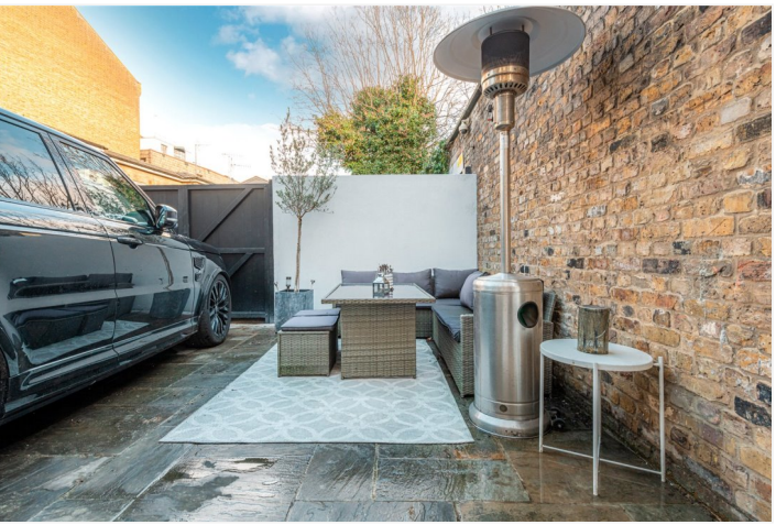
LADBROKE GROVE, W11 OFFERS OVER £1,000,000 LEASEHOLD