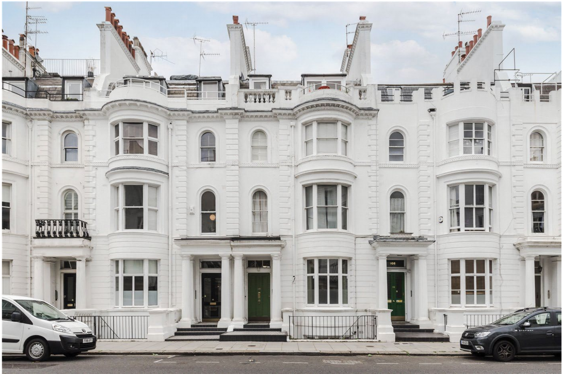
GLOUCESTER TERRACE, BAYSWATER, W2 GUIDE PRICE £395,000 LEASEHOLD