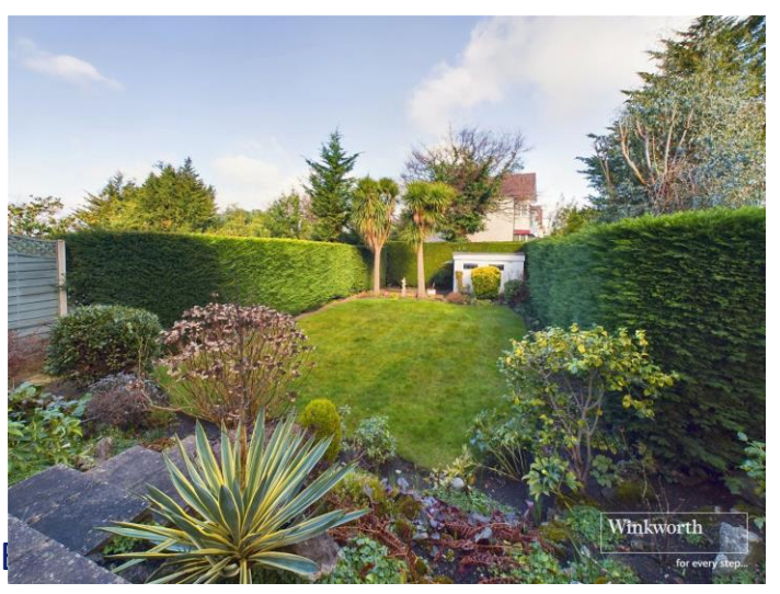
OFFERS IN EXCESS OF £995,000 FREEHOLD