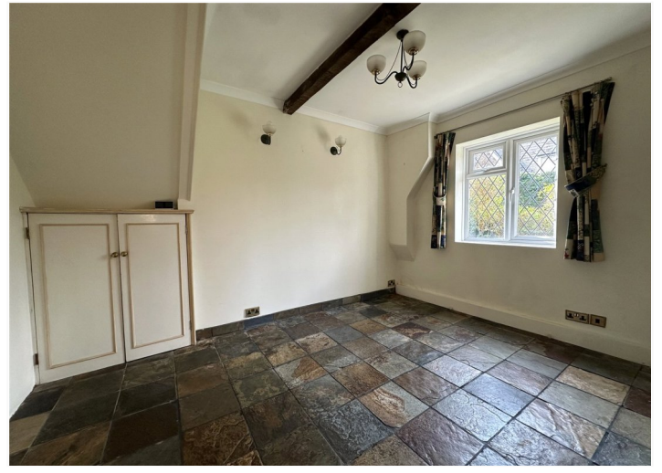
Drift Road, Bordon, Hampshire, GU35