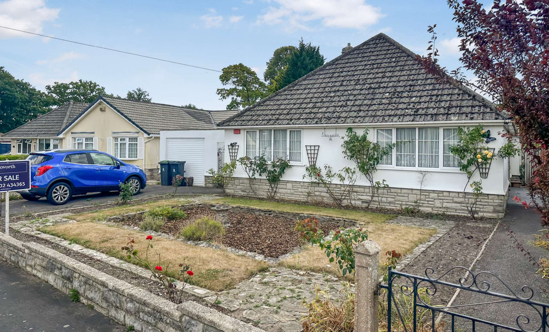
Linden Road West Parley, Ferndown BH22 8RR Guide Price £425,000