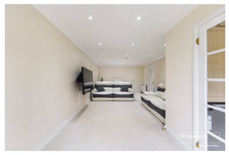
PEGASUS COURT, KENTON ROAD, HARROW, HA3 £365,000 LEASEHOLD