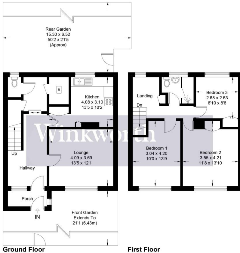
Illustration for identification purposes only, measurements are approximate, not to scale. Winkworth © 2025 (ID1168868)

Approximate Gross Internal Area = 97.9 sq m / 1054 sq ft