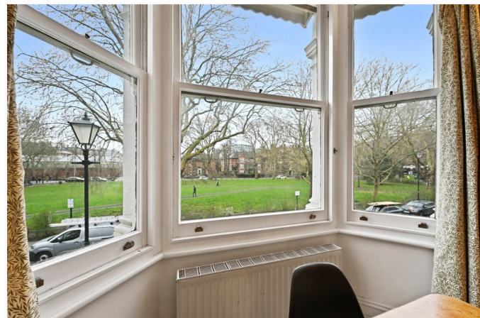
Brook Green, W6 £500,000 Share of Freehold

A fabulous one bedroom first floor flat, with views directly over Brook Green.