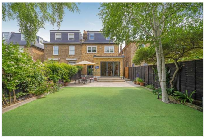
ELSIE ROAD, EAST DULWICH, SE22 £2,000,000 FREEHOLD

A STUNNING, SEMI-DETACHED FAMILY HOME, SITUATED ON ONE OF THE MOST SOUGHT-AFTER ROADS IN SE22.