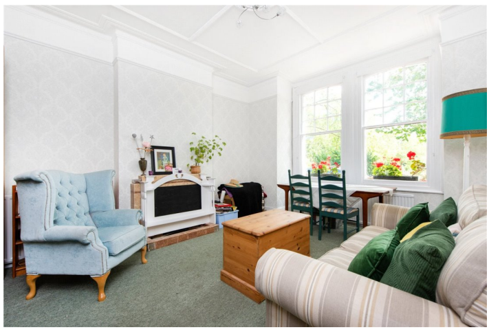
WATTISFIELD ROAD, LONDON, E5 £1,200,000 FREEHOLD

A RARELY AVAILABLE THREE BEDROOM PERIOD END OF TERRACE HOUSE WITH POTENTIAL TO EXTEND STPP & OVERLOOKING SOUTH MILLFIELDS RECREATION GROUNDS