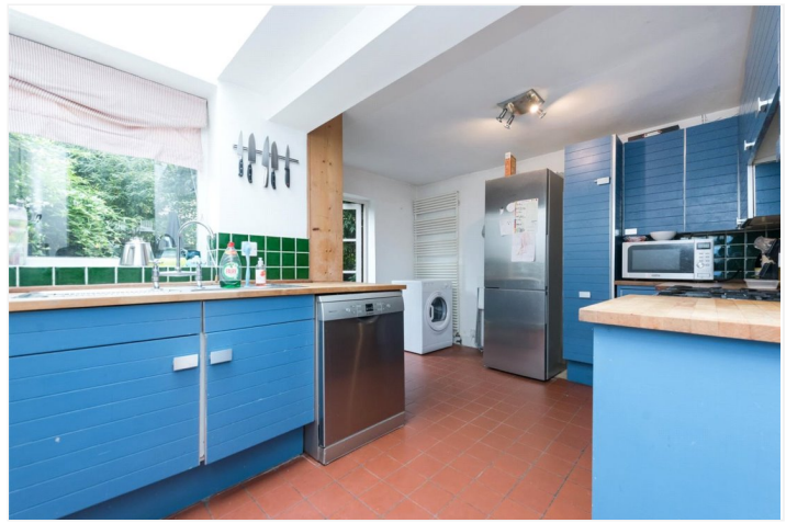
KILRAVOCK STREET, QUEENS PARK, W10 £500 PER WEEK UNFURNISHED