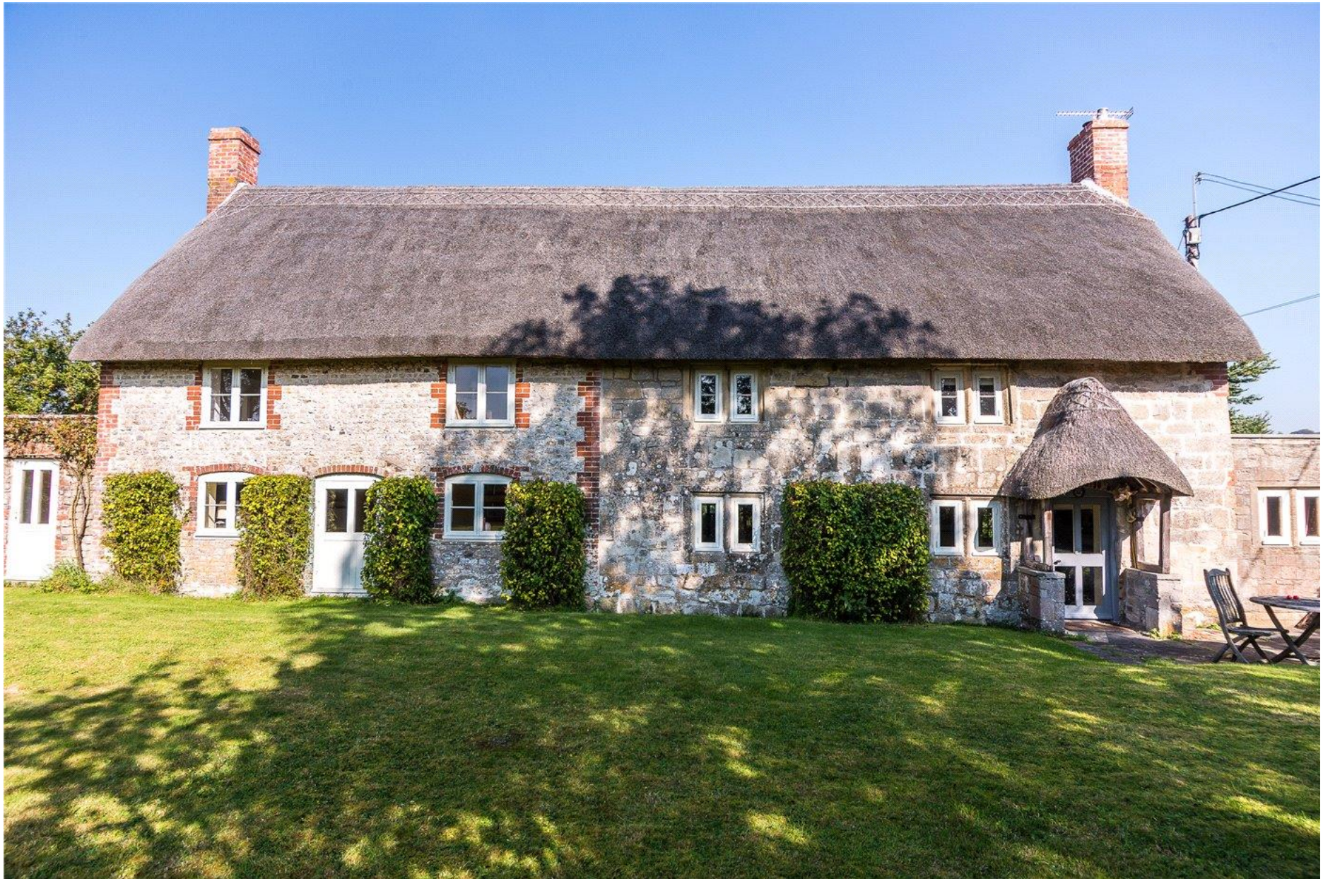
BUTTERFLY COTTAGE ,CORTON, WILTSHIRE, BA120SZ £2,500 PER CALENDER MONTH