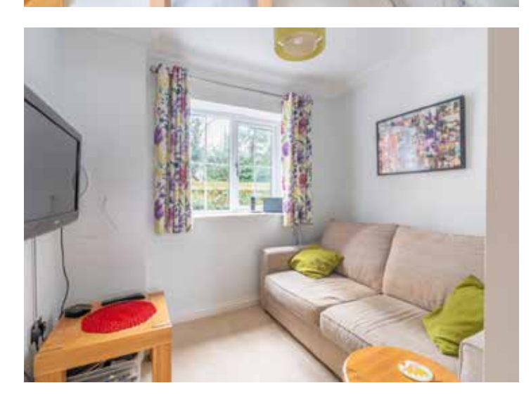
There is also a study.

The spacious kitchen/dining room features an orangery area with French doors to the garden. The kitchen has an excellent range of units, granite worktops, integrated fridge-freezer and dishwasher, 5-burner gas hob, cooker hood and Neff electric double oven.