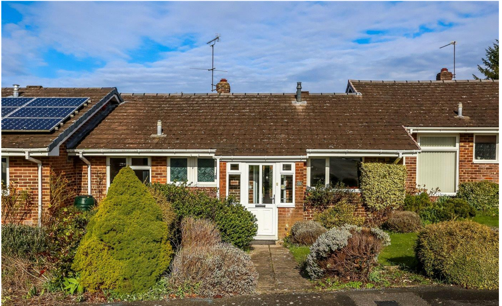
Ashley Close, Winchester, Hampshire, SO22 6LR