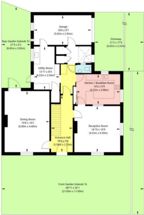
Ground Floor GROSS INTERNAL FLOOR AREA APPROX. 114.67 SQ M / 1234 SQ FT