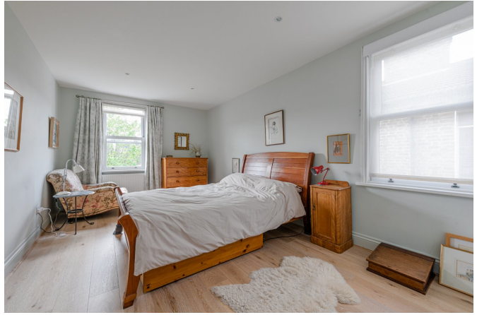
NIGHTINGALE ROAD, WILLESDEN JUNCTION, LONDON, NW10 £999,950 FREEHOLD

A LOVELY FOUR BEDROOM, THREE BATHROOM FAMILY HOME, ARRANGED OVER THREE FLOORS WITH SOUTH FACING GARDEN.