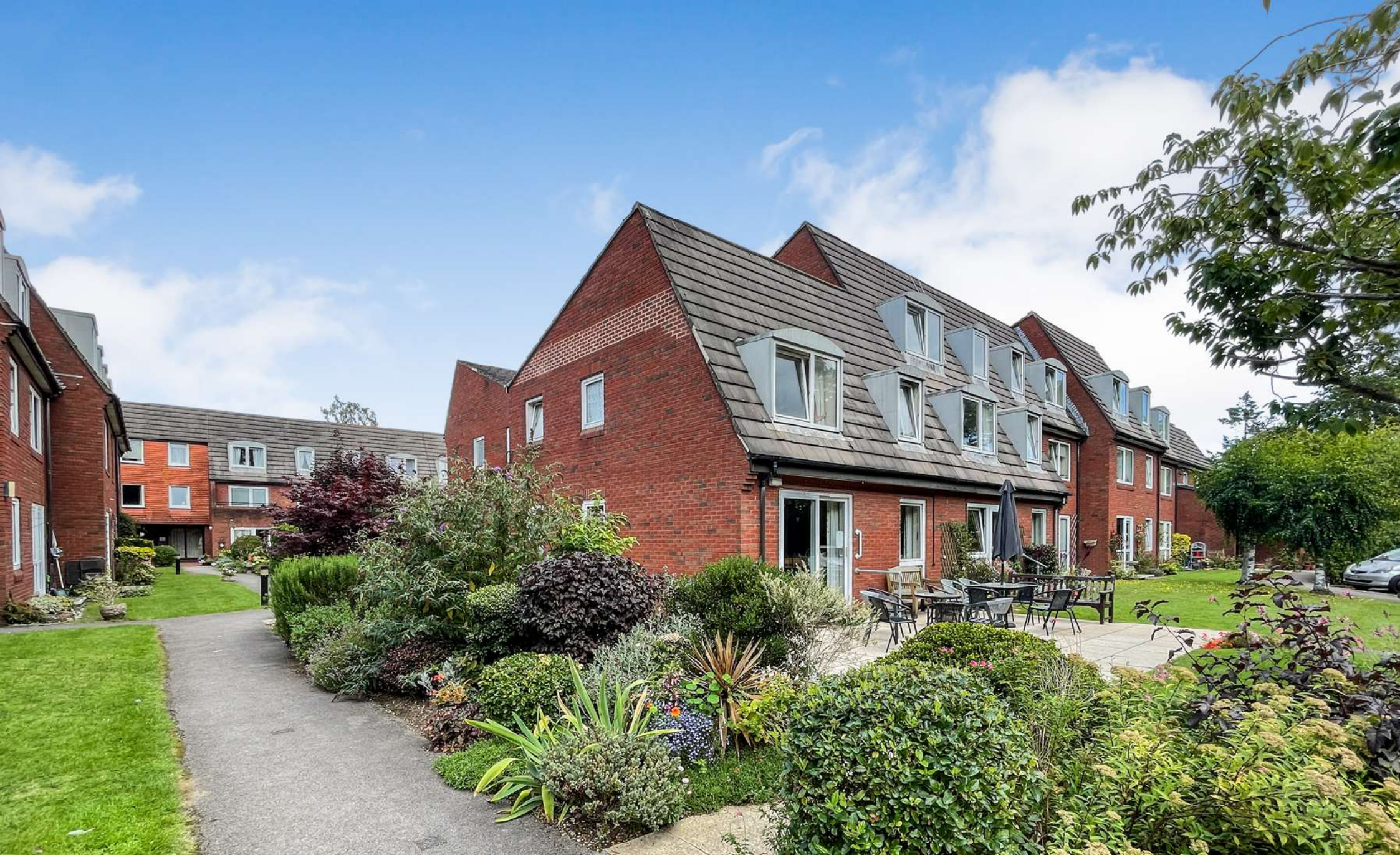
Homelands House, 535 Ringwood Road Ferndown, BH22 9DA Guide Price £75,000