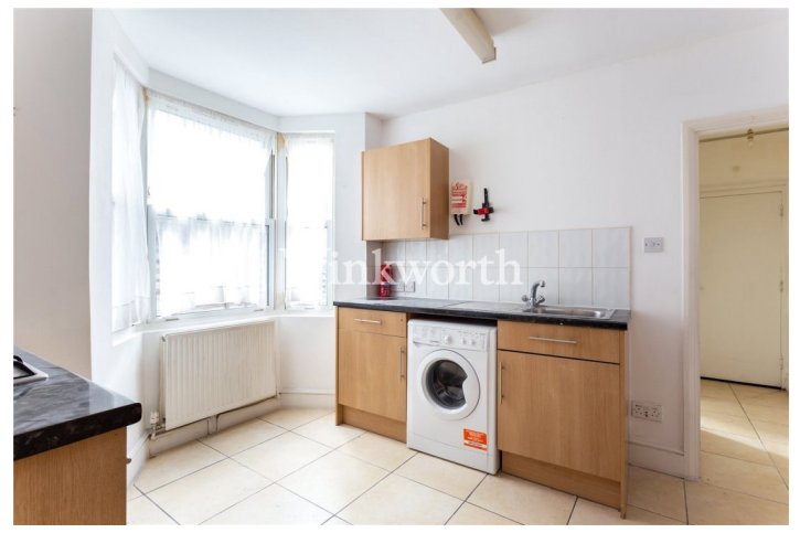
SUTHERLAND ROAD, LONDON, N17 £300,000 LEASEHOLD – UNDER OFFER AT £290,000