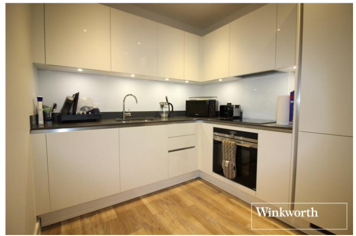
STATION ROAD, HERTFORDSHIRE, WD6 £1,800 PER MONTH UNFURNISHED