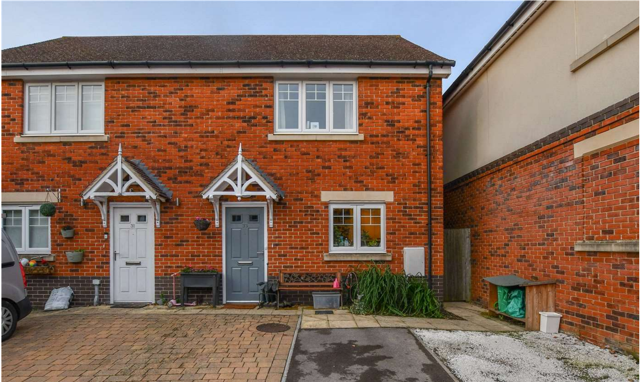
33 CARINA DRIVE, WOKINGHAM, BERKSHIRE, RG40 1BF £385,000 FREEHOLD