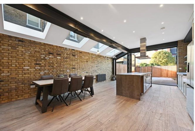
Second Avenue, Acton, W3