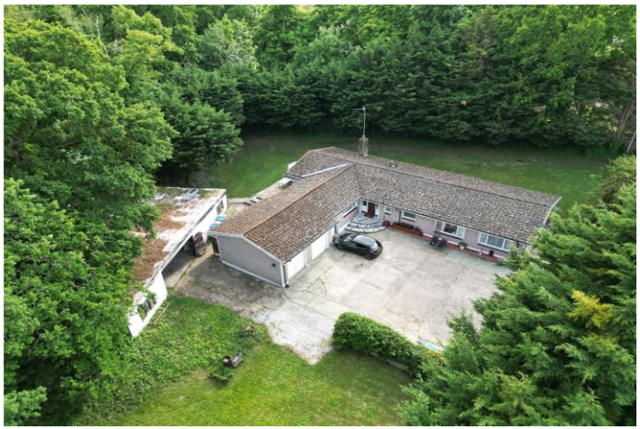
THE LODGE, KINGSBURY, LONDON, NW9 £1,500,000 FREEHOLD