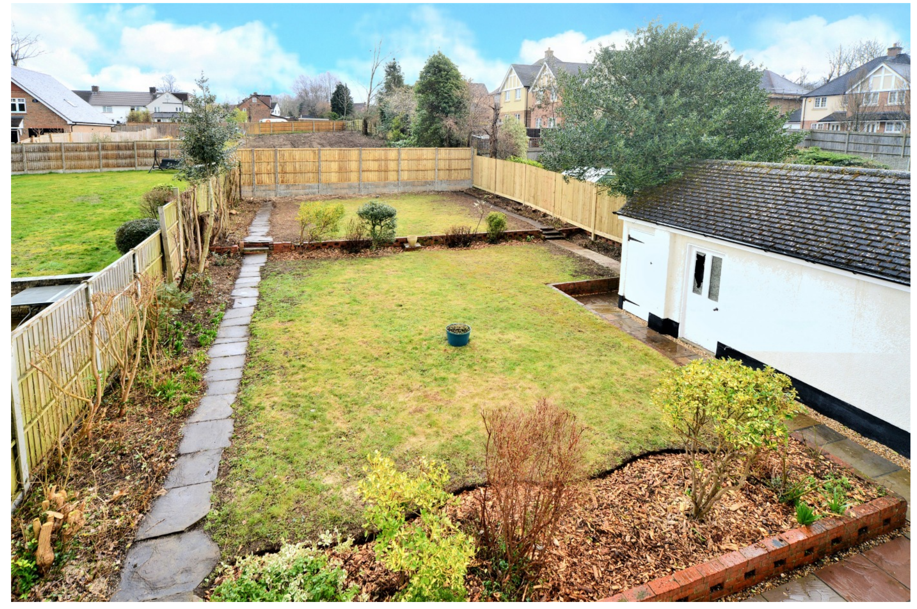
Under the Consumer Protection Regulations 2008, these Particulars are a guide and act as information only. All details are given in good faith and are believed to be correct at time of printing. Winkworth give no representation as to their accuracy and potential purchasers or tenants must satisfy themselves by inspection or otherwise as to their correctness. No employee of Winkworth has authority to make or give any representation or warranty in relation to this property.