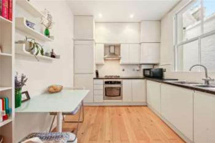
WESTBOURNE GROVE TERRACE, LONDON, W2 £1,245,000 LEASEHOLD

A RARELY AVAILABLE, OWN FRONT DOOR, GROUND AND LOWER MAISONETTE WITH THREE BEDROOMS, LOCATED JUST OFF THE SOUGHT-AFTER WESTBOURNE GROVE.