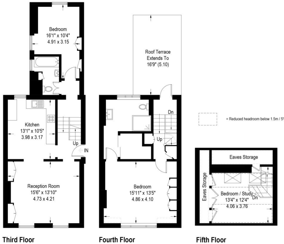
Illustration for identification purposes only, measurements are approximate, not to scale. (ID501842)

This floorplan is for illustration purposes only and is not to scale. The position and size of doors, windows, appliances and other features are approximate.