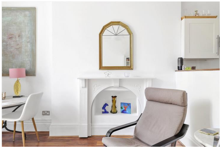
ALEXANDER STREET, W2 £795 PER WEEK (£3,445.00 PCM) FURNISHED