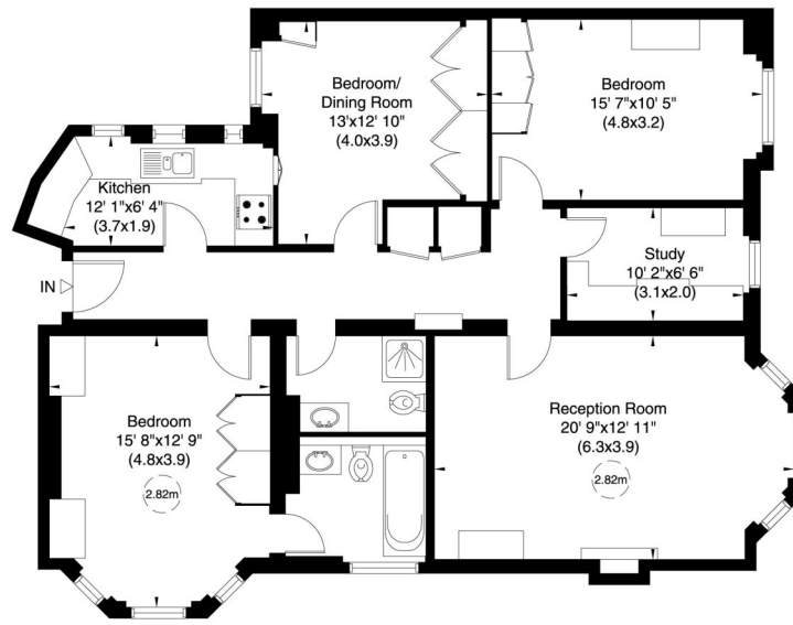
Raised Ground Floor

For guidance only and must not be relied upon as a statement of fact. All measurements and areas are approximate only (and have been prepared in accordance with the current edition of the RICS Code of Measuring Practice).